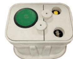
Vault for ST-1600-B system